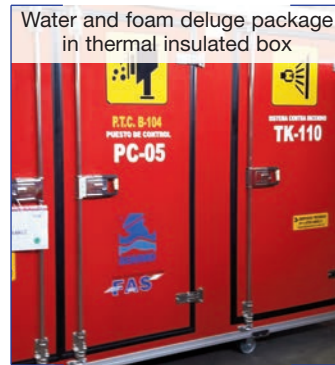
Water and foam deluge package in thermal insulated box