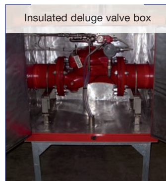
Insulated deluge valve box