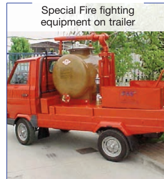
Special fire fighting equipment on trailer