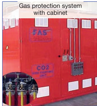
Gas protection system with cabinet