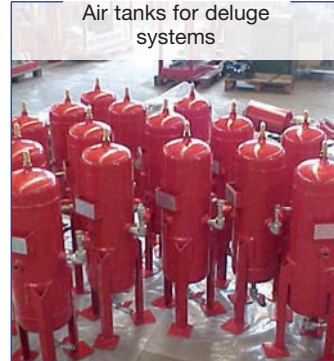
Air tanks for deluge systems