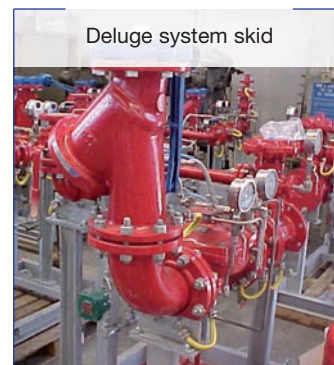
Deluge system skid