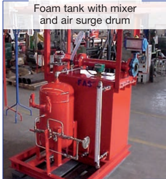
Foam tank with mixer and air surge drum