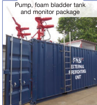
Pump, foam bladder tank and monitor package