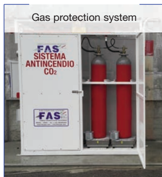
Gas protection system