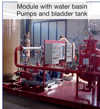
Module with water basin pumps and bladder tank