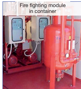
Fire fighting module in container